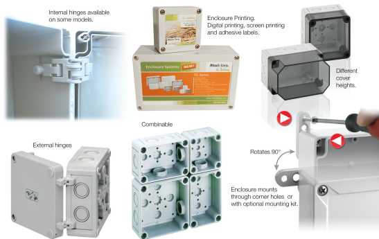
Figure 2: Additional advantages for

switchgear, safety and security wiring, as well as the highly sophisticated electronics now being used in agricultural businesses around the world. Plus, these enclosures offer livestock safety.