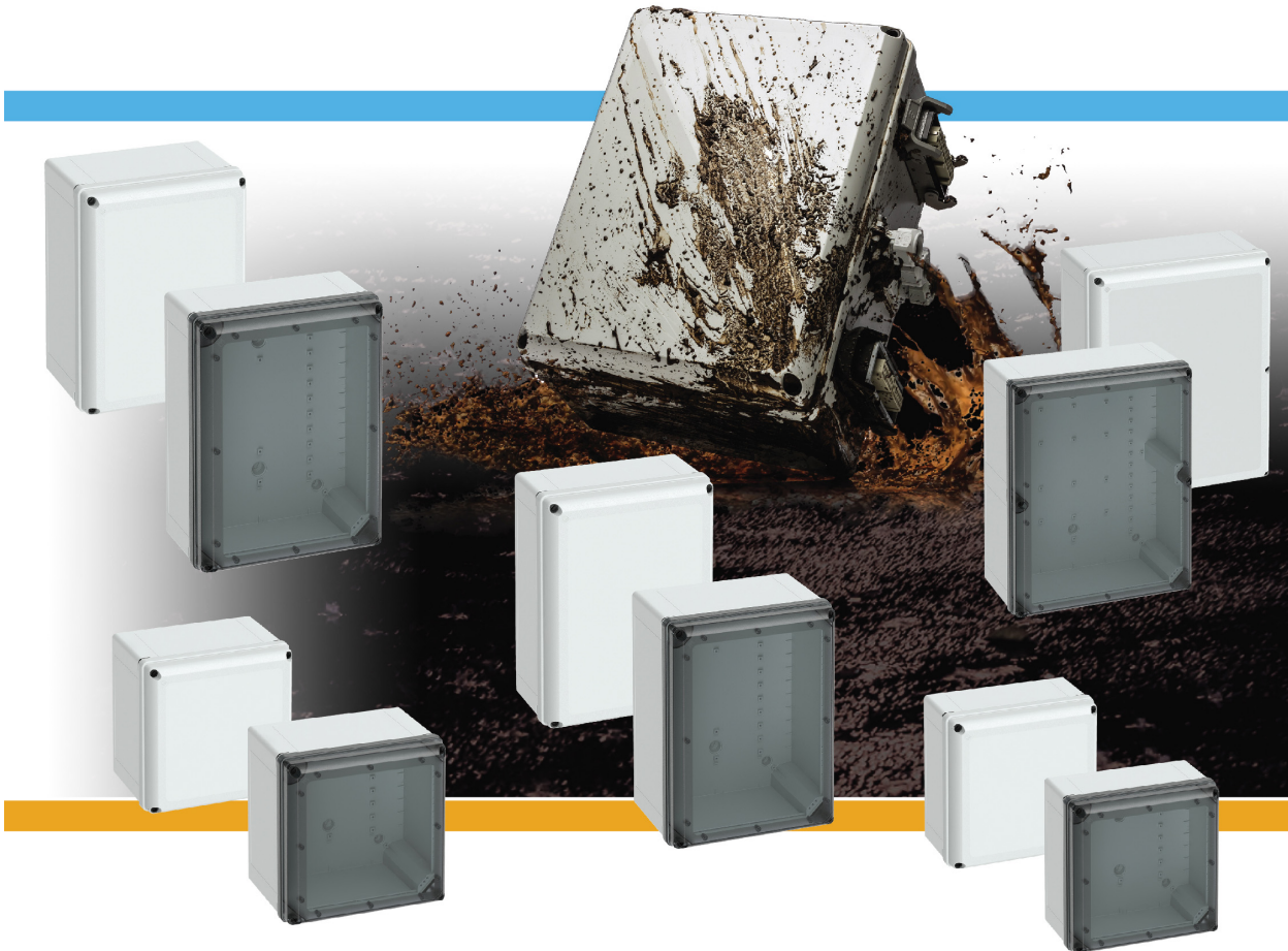
Figure 1: The GEOS line of harsh environment outdoor industrial enclosures.

At first thought, it might not seem as if enclosures would be an important element in electrical system design. But upon closer inspection, and especially when you consider that they can contain electrical wiring, fiber optic devices, microcontrollers, routers, switches, power supplies and other components, it becomes clear that when properly designed these boxes play a vital role in protecting against high temperatures, moisture and humidity.