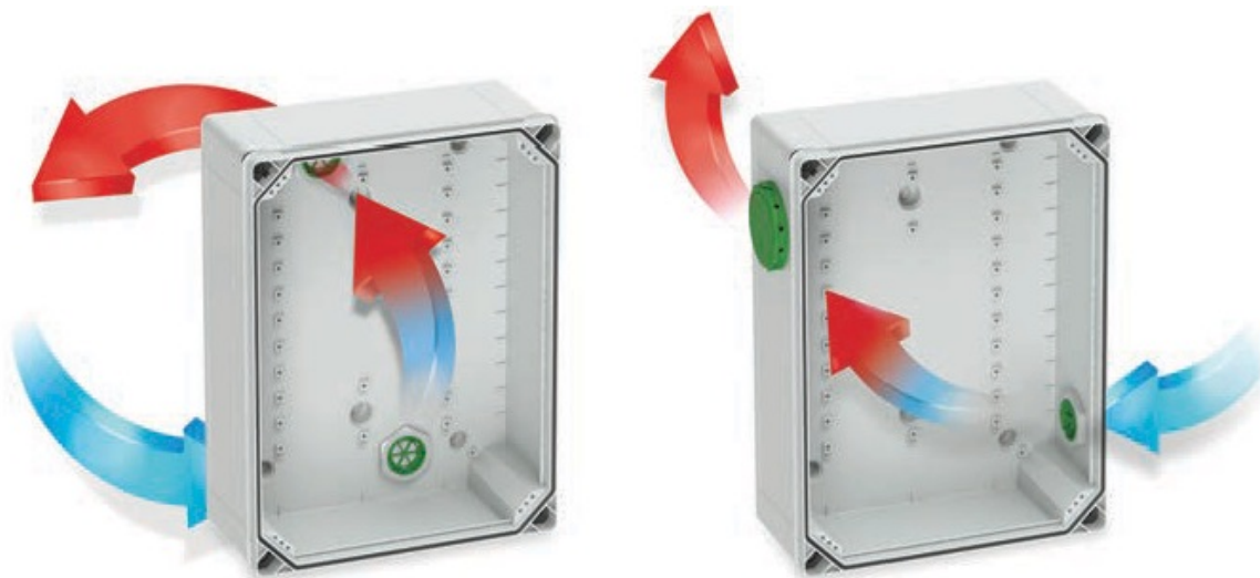
Figure 3: An optional patented ventilation element provides continuous air exchange to prevent condensation.

When appropriate devices and wiring are installed, this temperature can be even higher. The warm air in the enclosure gradually absorbs the water vapor contained in the ambient air. If the outside temperature falls, then the outer walls of the enclosure cool down. When the dew point temperature is reached, the water vapor contained in the air condenses on the inside of the enclosure as condensate. This water collects in the box and may cause damage.