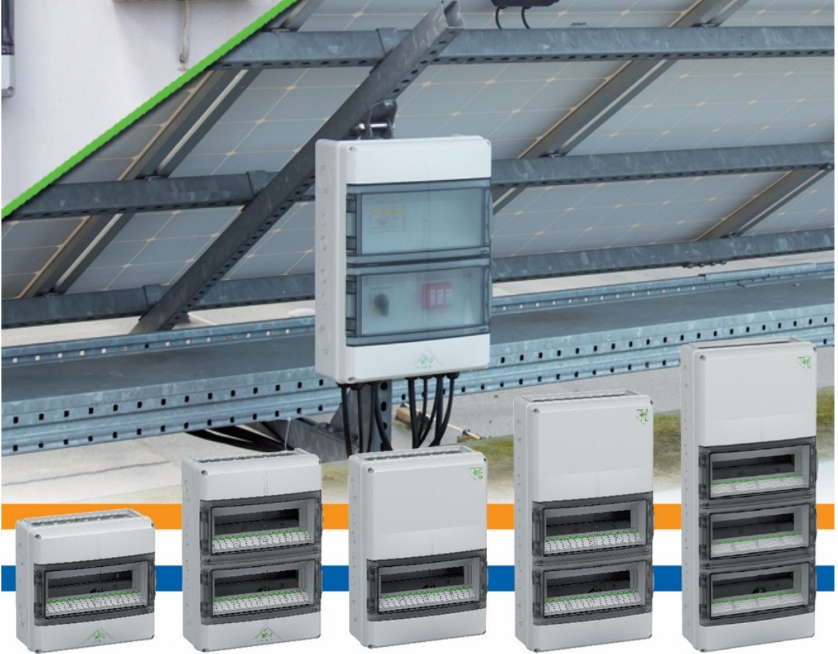
Figure 3: The AKIII series comes in a variety of enclosure sizes.

The interior of the AKIII serves to accommodate the equipment and is fitted with various mounting options depending on the variant. In all, there are seven different models. The difference among them is how much space they have for components. Four models are basically single-door, double-door, triple-door and four-door enclosures for circuit breakers or timers. The single door is a 14 circuit breaker enclosure. Similarly, the double door is 28, the triple door 42 and the four-door can hold 56 breakers.