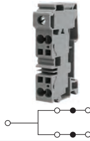
1 Flat Head Screw Input 4 Spring Clamp Outputs